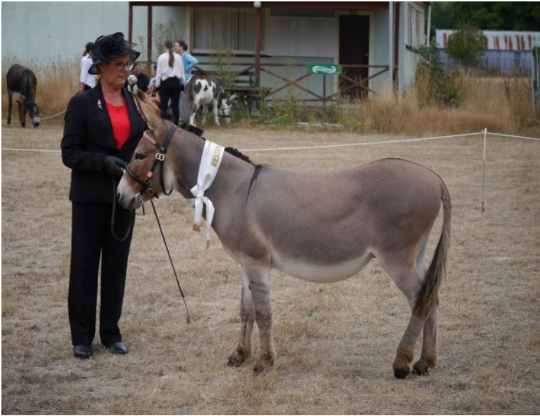
Flaxton Green Macauley